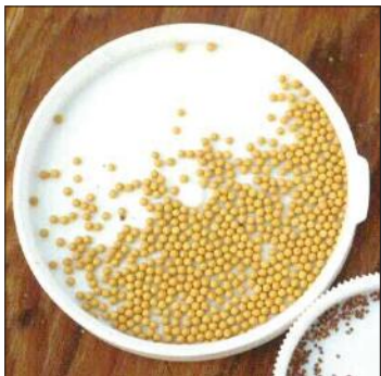
Pelleted with a melting coating that dissolves when wetted.