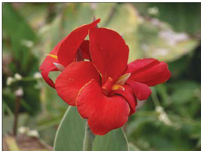
Canna flowers come in a wide variety of colors and patterns.

The white variety with the bright yellow spadix is familiar to most of us. However, callas can be pink, yellow, orange, maroon, or coral in color.