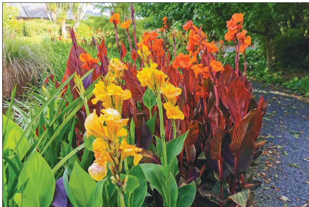
Canna lilies attract butterflies and hummingbirds and are listed as deer resistant.

the ASPCA lists as toxic to dogs and cats. Personally, I have these in my yard and have never