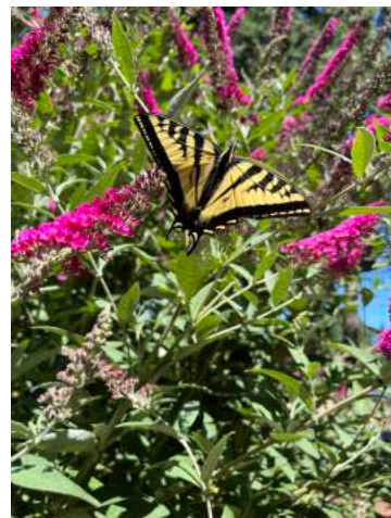
The DG Butterfly Garden is living up to its name with Swallowtails hovering all around this 'Miss Molly' Buddleia!