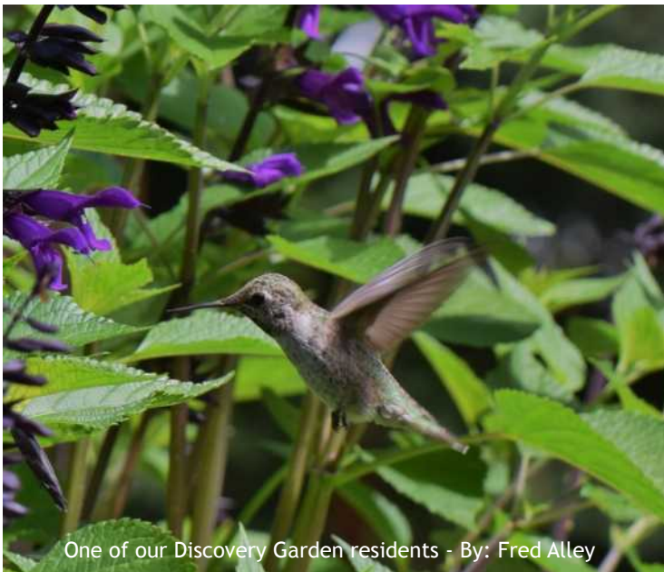
One of our Discovery Garden residents - By: Fred Alley