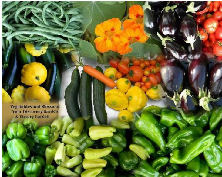
Victory Garden Collage by Fred Alley