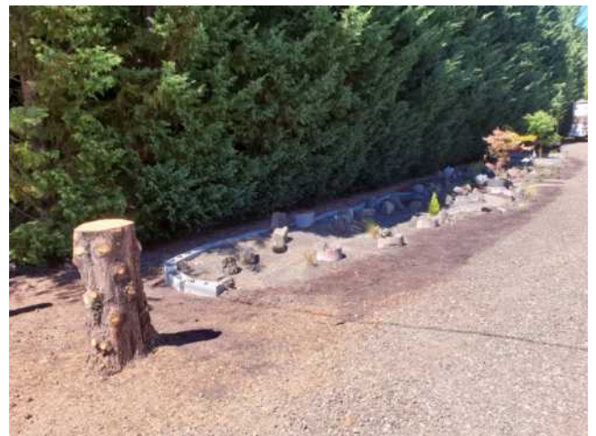
Kish created more sun for her rock garden by removing Leyland cypresses.