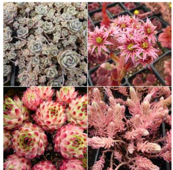
Succulents from ESG

Bring your chair, a mask & please social distance The Awards Committee will be printing items for those attending the Awards Gathering. If you would please RSVP, we can be better prepared to honor our membership.