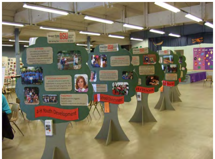
Extension Service display at the Douglas County Fair