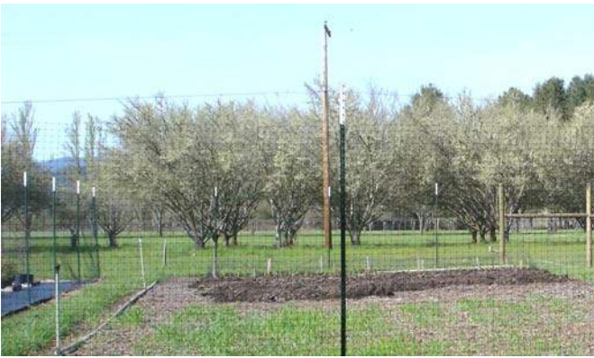
The Victory Garden—thru the new deer fence