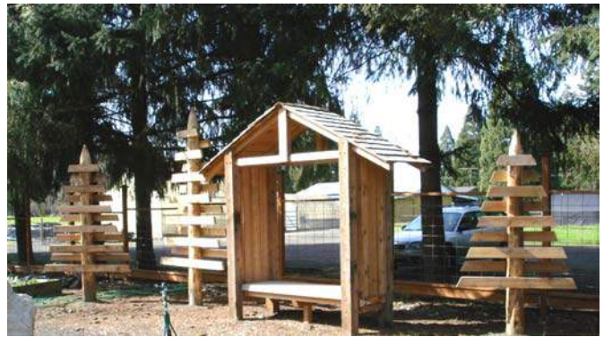
Donor Board displays in the Discover Garden