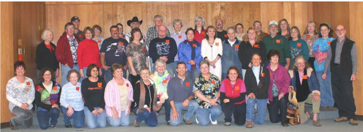
The Master Gardener Graduates: Class of 2010