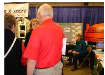
MG's Home Show Booth